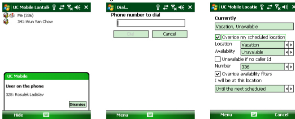
Windows® Mobile Professional

By integrating presence, messaging, mobility and computer telephony, Esnatech's mobile UC software offers a complete communications and collaboration solution for all enterprises. Delivering fixed-to-mobile convergence for a wide variety of wireless devices with enterprise PBX systems such as Cisco, Avaya, Nortel, Mitel, Iwatsu, AASTRA, Asterisk, eOn, Toshiba, Teltronics, etc. With the integration of UC on the latest Windows Mobile wireless devices,